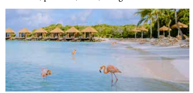
CELEBRITY CRUISE TO ARUBA, BONAIRE, AND CURACAO October 5–13

Spend a summer vacation in the jewel of the Atlantic. Cruise aboard Royal Caribbean International's Vision of the Seas round trip from the port of Baltimore with stops in Bermuda and Royal Caribbean's exclusive Coco Cay. Package includes round trip bus transportation, all meals, entertainment, port fees, taxes, and gratuities.