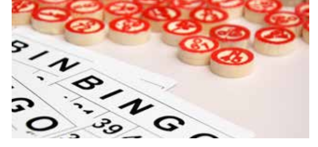
BEER AND BINGO Open to all; registration required Tuesday, March 12, 5:00–6:30 pm

Come try your luck at multiple games of bingo and win top prizes such as gift cards, cash prizes, and the biggest prize: one month of Center membership! One regular coffee, tea, beer, or wine is included. Members $10; Guests $15. One bingo board included, $5 per additional board.