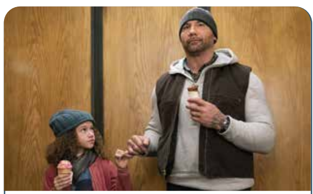
MOVIE NIGHT Free and open to all; registration encouraged 1st and 3<sup>rd</sup> Wednesdays each month,