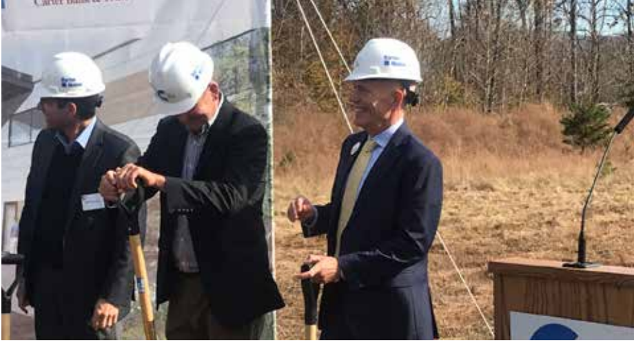
Groundbreaking at The Center at Belvedere in 2018